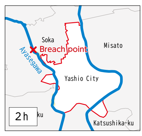
The flood reaches Yashio within 2 hours.