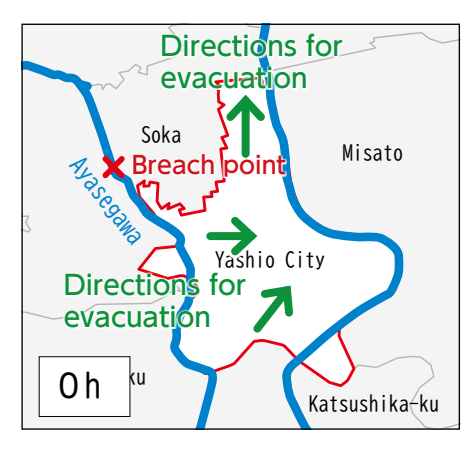
Levee breach in the upper stream of Ayasegawa.