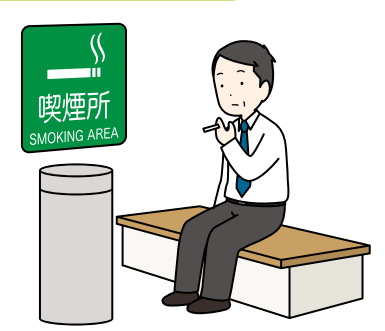
Follow the rules to cohabitate with others peacefully.