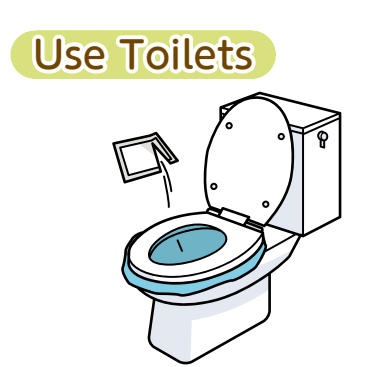
Clean toilets in cooperation with others and keep them in a hygienic condition.

Inform disaster relief staff if you need special assistance or have concerns regarding your current situation.