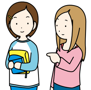
Avoid going off by yourself and try to engage in group activities as much as possible.