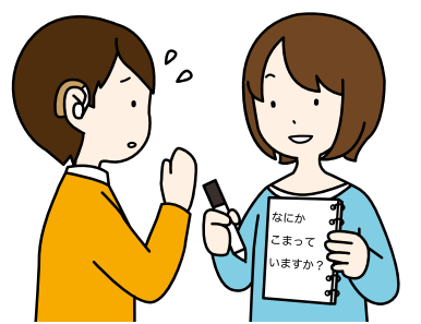
Inform people with hearing impairments through writing or using smartphones.