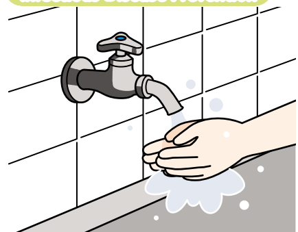
Wash your hands and gurgle frequently.