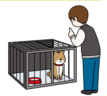
Pet owners must be responsible and take care of their pets.